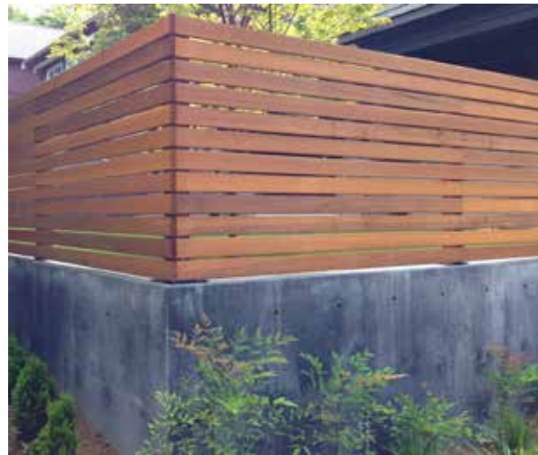
Example of conc. retaining wall topped with a timber panel fence. Proposed fence will be double-sided for presentation and full visual screening.