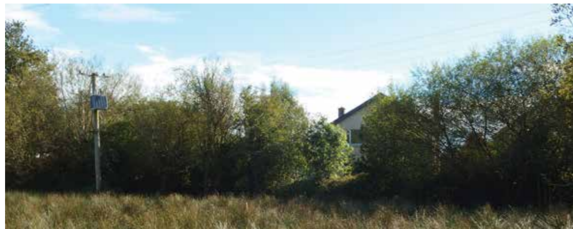
Image of south boundary as viewed from within site.